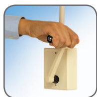
Steel Cable Winder (Up To 50Kg)*