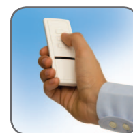
Remote Control With 240V Electric SIMU Hz Motor