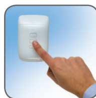
PowerSmart™ Control System With 12V Motor (Up To 50Kg)*