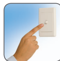
Wall Switch With 240V Electric Motor*