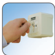
Key Switch With 240V Electric Motor