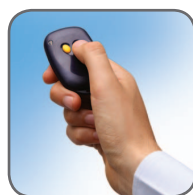
S-05 Remote Control (Key Ring Transmitter) With 240V Electric Motor & Multi-Function S-05 Radio Receiver & Control Unit

* Control options must be installed in an indoor environment.