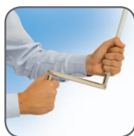
Crank Handle With 240V Electric Manual Override Motor