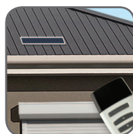
Remote Control With SolarSmart™ Automation 12V Motor (Up To 50Kg)