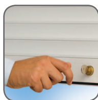
Spring Loaded With Key Lock